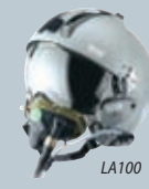
Helmets for Jet-Fighters Pilots